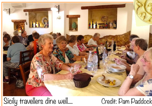
Sicily travellers dine well...

If things go well sometimes events are repeated so keep an eye out if there's something you missed, but get in quick!