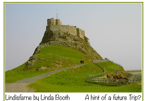
Lindisfarne by Linda Booth A hint of a future Trip?

Welcome back to the Sicily trip travellers - see p4 for a couple of preliminary photos