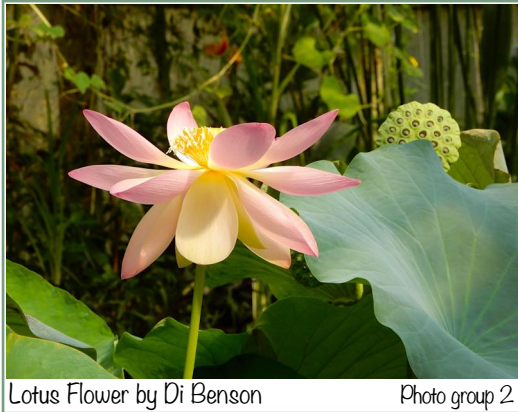
Lotus Flower by Di Benson