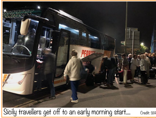
Sicily travellers get off to an early morning start...